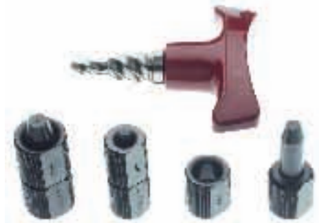
Installation tools for automatic pre-assembly and calibration tools.

No additional sealing gasket required. The seal is metal-to-metal via the sealing edge in the clamping ring.